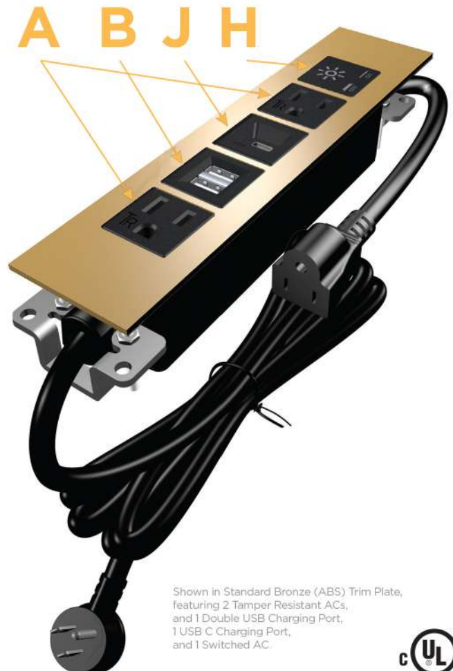
Shown in Standard Bronze (ABS) Trim Plate, featuring 2 Tamper Resistant ACs, and 1 Double USB Charging Port, 1 USB C Charging Port, and 1 Switched AC.