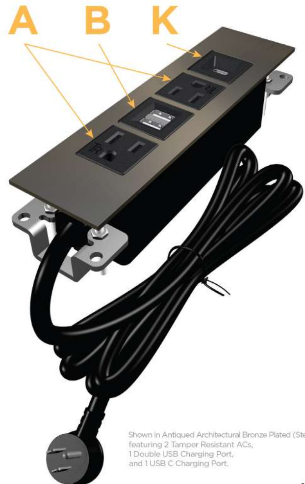
Shown in Antiqued Architectural Bronze Plated (Steel) Trim Plate, featuring 2 Tamper Resistant ACs, 1 Double USB Charging Port, and 1 USB C Charging Port.