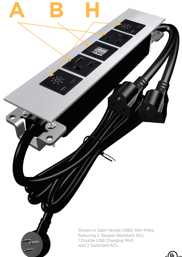
Shown in Satin Nickel (ABS) Slim Plate, featuring 2 Tamper Resistant ACs, 1 Double USB Charging Port, and 2 Switched ACs.