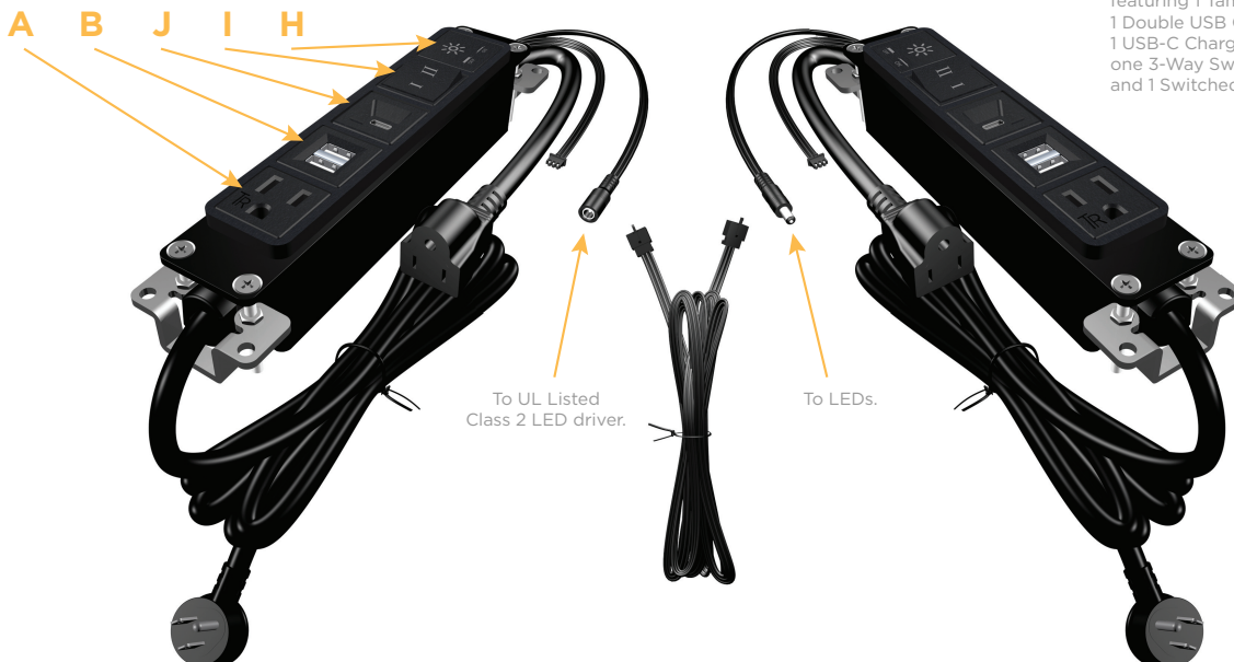
Shown in Black (ABS) Bezel, featuring 1 Tamper Resistant AC, 1 Double USB Charging Port, 1 USB-C Charging Port, one 3-Way Switch, and 1 Switched AC.