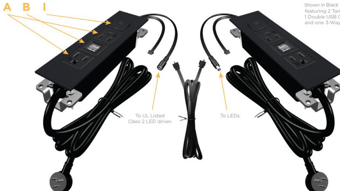
Shown in Black Powder Coated (Steel) Slim Plate, featuring 2 Tamper Resistant ACs, 1 Double USB Charging Port, and one 3-Way Switch.