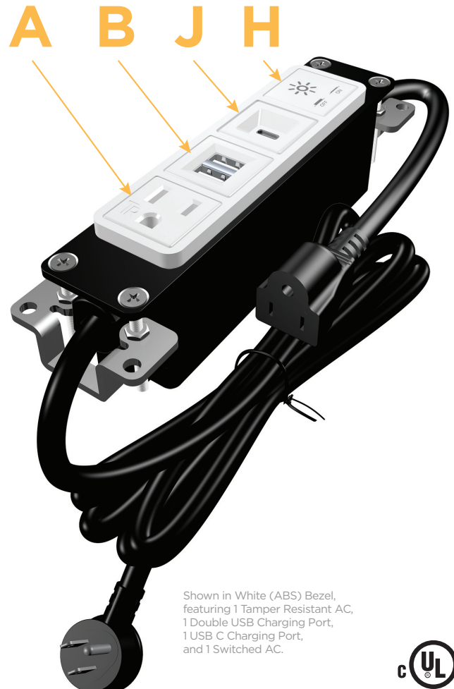
Shown in White (ABS) Bezel, featuring 1 Tamper Resistant AC, 1 Double USB Charging Port, 1 USB C Charging Port, and 1 Switched AC.