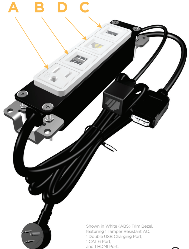
Shown in White (ABS) Trim Bezel, featuring 1 Tamper Resistant AC, 1 Double USB Charging Port, 1 CAT 6 Port, and 1 HDMI Port.