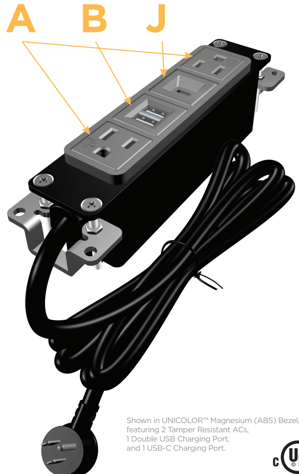
Shown in UNICOLOR™ Magnesium (ABS) Bezel, featuring 2 Tamper Resistant ACs, 1 Double USB Charging Port, and 1 USB-C Charging Port.