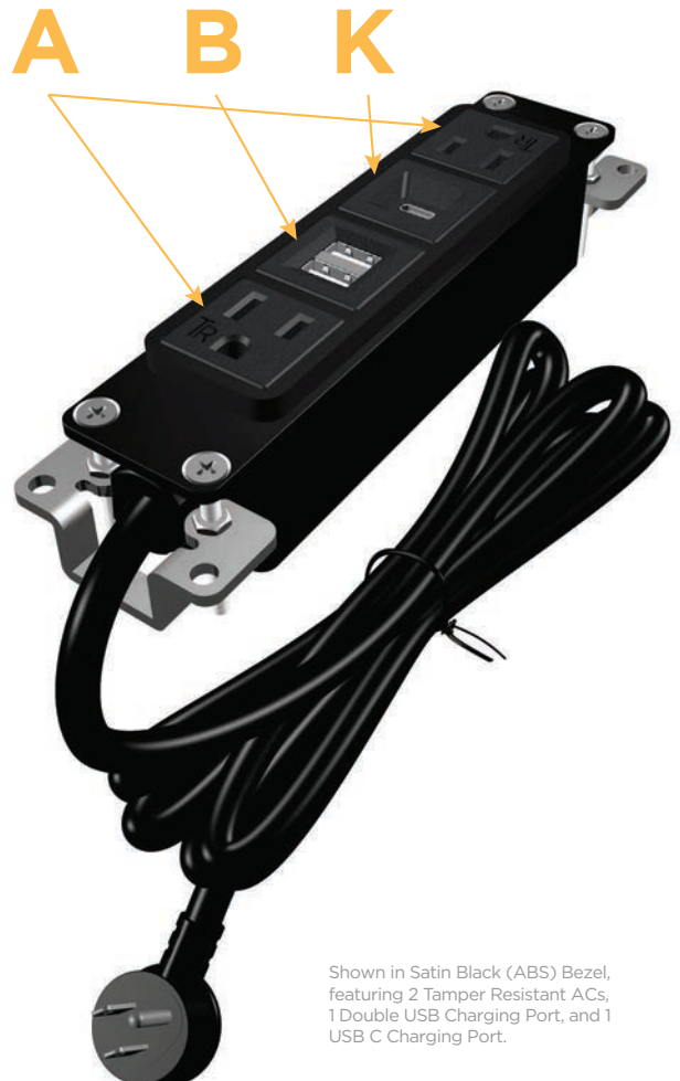
Shown in Satin Black (ABS) Bezel, featuring 2 Tamper Resistant ACs, 1 Double USB Charging Port, and 1 USB C Charging Port.