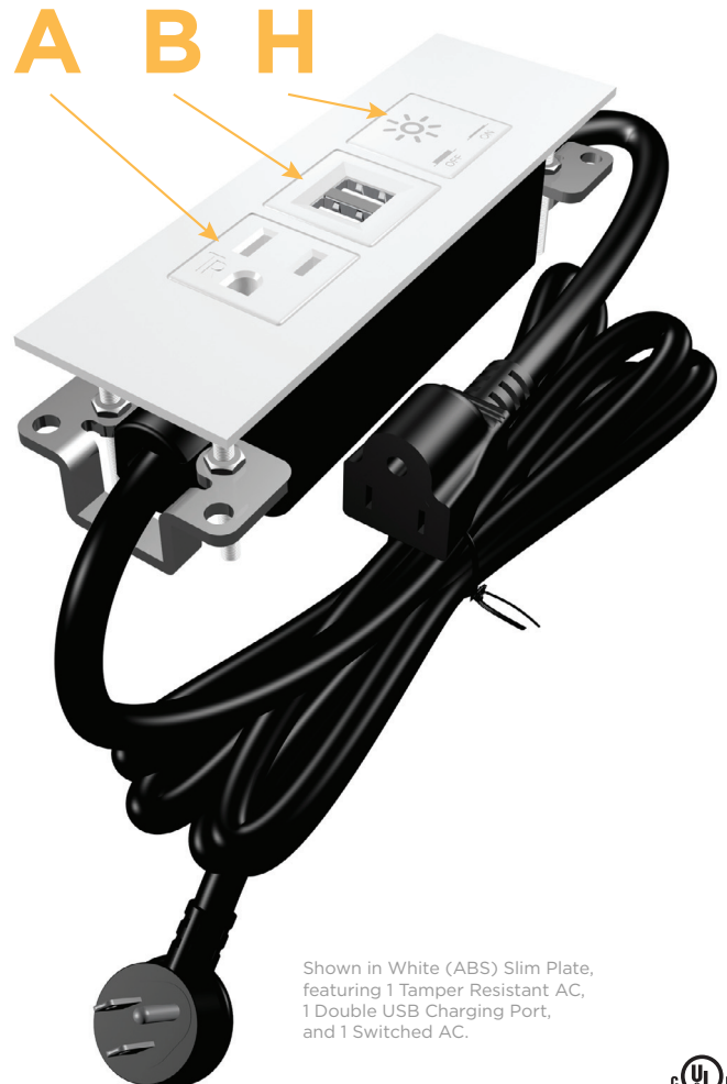
Shown in White (ABS) Slim Plate, featuring 1 Tamper Resistant AC, 1 Double USB Charging Port, and 1 Switched AC.