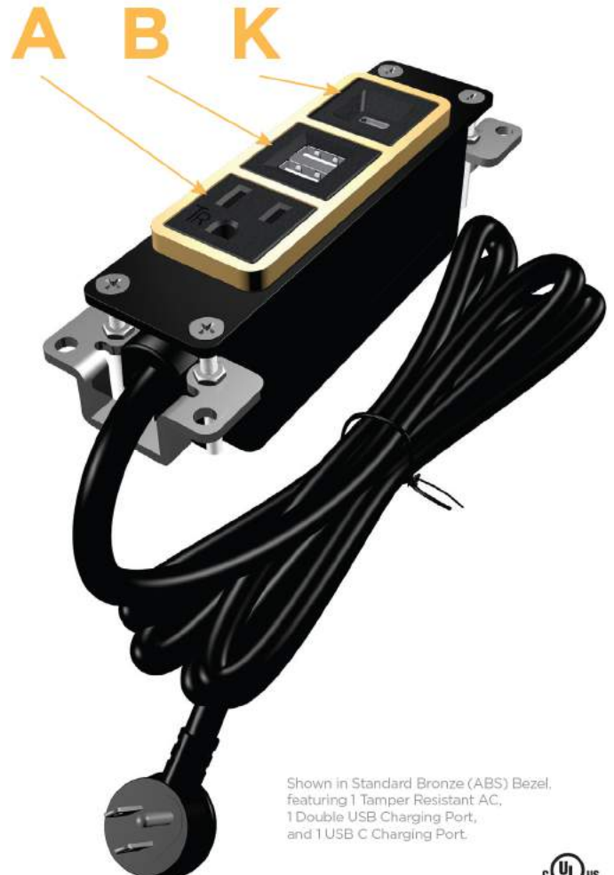
Shown in Standard Bronze (ABS) Bezel, featuring 1 Tamper Resistant AC, 1 Double USB Charging Port, and 1 USB C Charging Port.