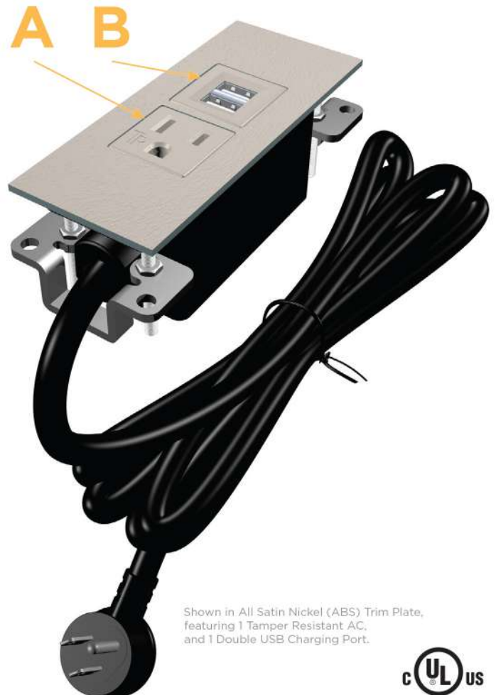
Shown in All Satin Nickel (ABS) Trim Plate, featuring 1 Tamper Resistant AC, and 1 Double USB Charging Port.