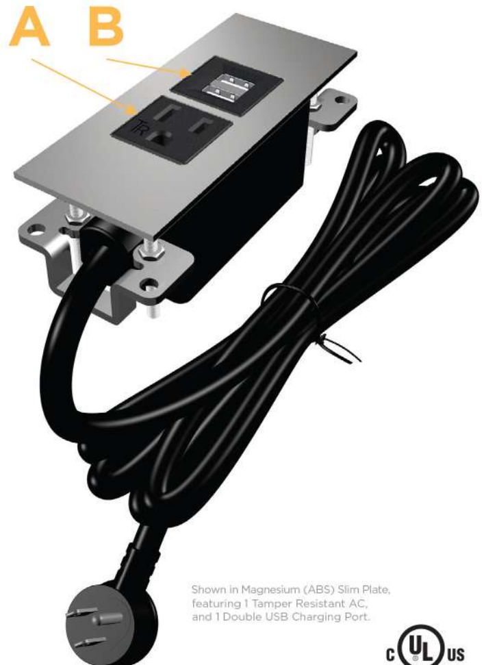
Shown in Magnesium (ABS) Slim Plate, featuring 1 Tamper Resistant AC, and 1 Double USB Charging Port.