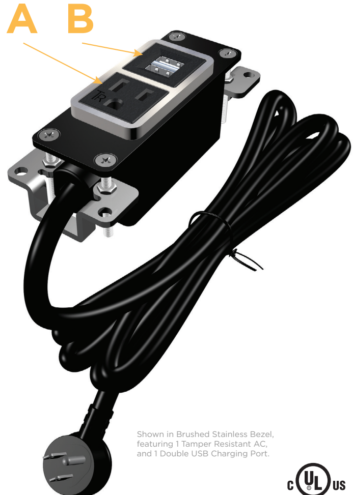
Shown in Brushed Stainless Bezel, featuring 1 Tamper Resistant AC, and 1 Double USB Charging Port.