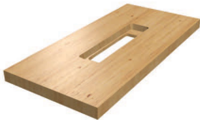
CUT HOLE IN BOTTOM