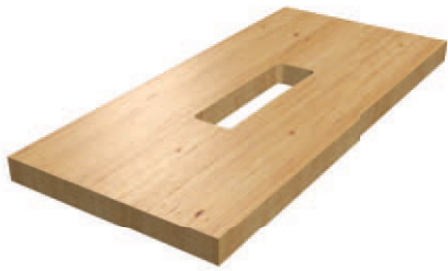
CUT HOLE IN TOP

914-699-0101 sales@mormax.com mormax.com