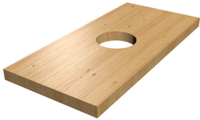
CUT HOLE IN TOP

1 Rout/cut top of wood/stone/etc. for outlet bezel as indicated on template labeled "TOP TEMPLATE".