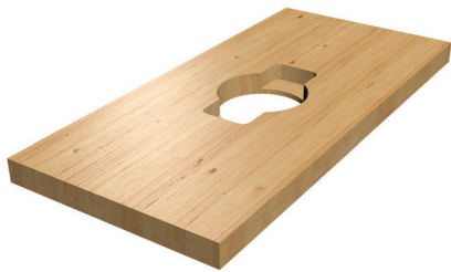
CUT HOLE IN BOTTOM

1 Rout/cut top of wood/stone/etc. for outlet bezel as indicated on template labeled "TOP TEMPLATE".